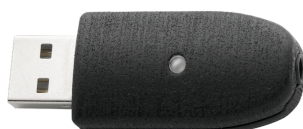
52111057 USB adaptor