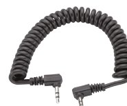
52110052 Spiral cable