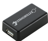
52110061 Interface adaptor