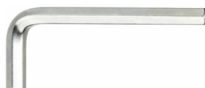
43150002 Hexagon key wrench