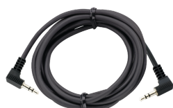
52110051 Jack cable