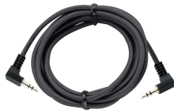
52110051 Jack cable