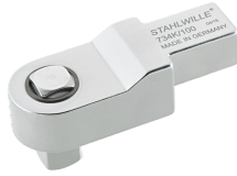
58243004 Calibrating square drive insert tool