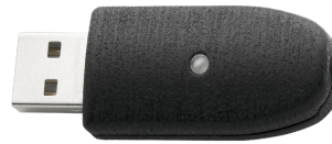
52111057 USB adaptor