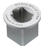
58521089 Square drive adaptor