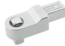
58243020 Calibrating square drive insert tool