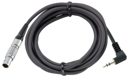
52110054 Cable for No.7728