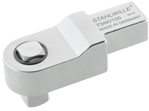
58243005 Calibrating square drive insert tool