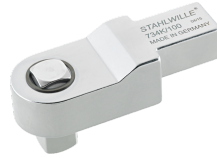
58243040 Calibrating square drive insert tool