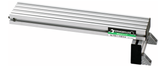
52110191 Extension unit for No.7791, 7794-1 and 7794-2 up to 1000 N·m