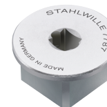
58521087 Square drive adaptor