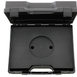
81500003 Plastic case, empty