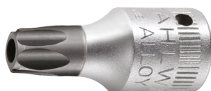
01351010 Screwdriver socket