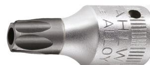
01351008 Screwdriver socket