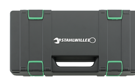
81271013 Socket set