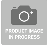
51110057 USB cable