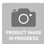
83826781 Insert for torque spanner set