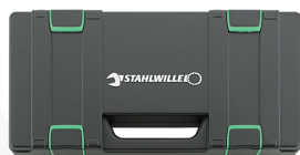
81271013 Socket set