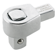
58240040 Square drive insert tool