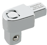
58240010 Square drive insert tool