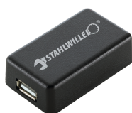
52110061 Interface adaptor