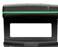
52110220 Bluetooth modules for torque wrench