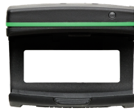
52110220 Bluetooth modules for torque wrench