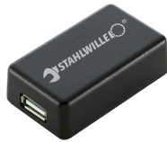
52110061 Interface adaptor