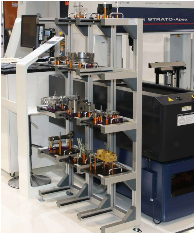
K543826 15 fold 250mm x 250 mm customized pallet rack

Other pallet dimensions and additional storage locations on request.