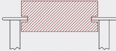
Check external groove Controllo gole esterne